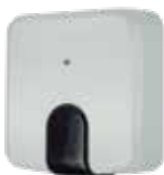
IS-IR-WMP-1 Universal Infrared AC 1 Indoor Unit