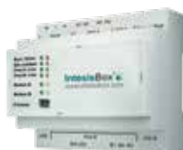
IBMBSMITXXXC000 City Multi systems 50/100 Indoor Units