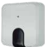
IS-IR-KNX-1i Universal Infrared AC 1 I.U. with Binary Inputs