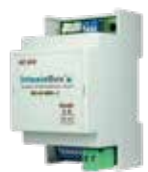
ME-AC-MBS-1 Domestic, Mr.Slim & City Multi lines to Modbus 1 Indoor Unit