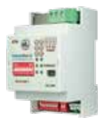
ME-AC-BAC-1 Domestic, Mr.Slim & City Multi lines to BAC IP&MSTP 1 Indoor Unit