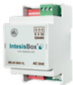
IBBACMIT0011000 Domestic, Mr.Slim & City Multi lines to BAC MSTP 1 Indoor Unit