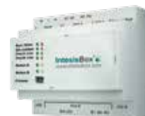
IBKNXMITXXXC000 City Multi systems 15/100 Indoor Units