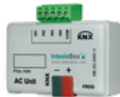
ME-AC-KNX-1i Domestic, Mr.Slim & City Multi lines to KNX 1 I.U. with Binary Inputs